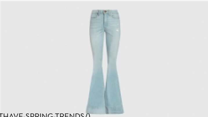
MUST-HAVE SPRING TRENDS (/BLOG/ENTRIES/722/MUSTHAVE-SPRING-TRENDS/) (/blog/entries/722/musthave-spring-trends/)