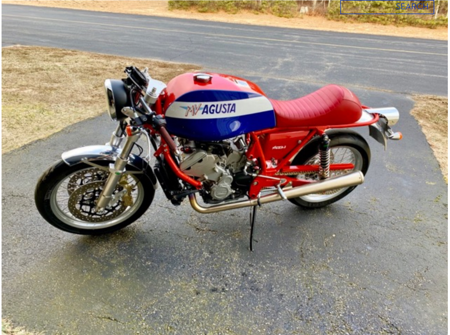
(Pictured above: 2019 MV Agusta Tributo Stuart Parr Edition)

It's a combination of all of those elements - it's an affinity for something that you see once and never forget.