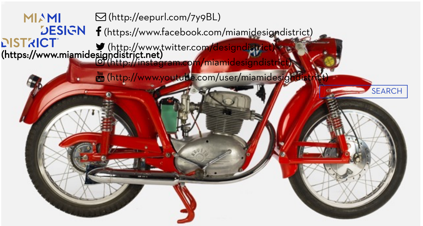
(Pictured above: 1954 MV Agusta 175 CS Sport)

You have some of the friendliest-looking cars ever designed in your collection. What's that about?