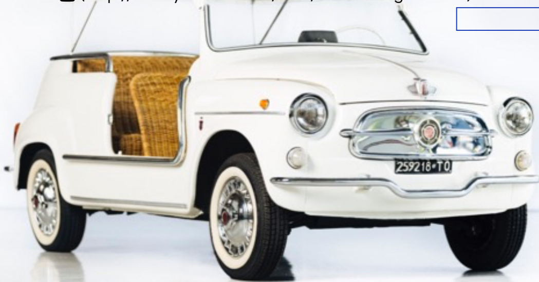
(Pictured above: 1958 Fiat Jolly 750 Abarth)