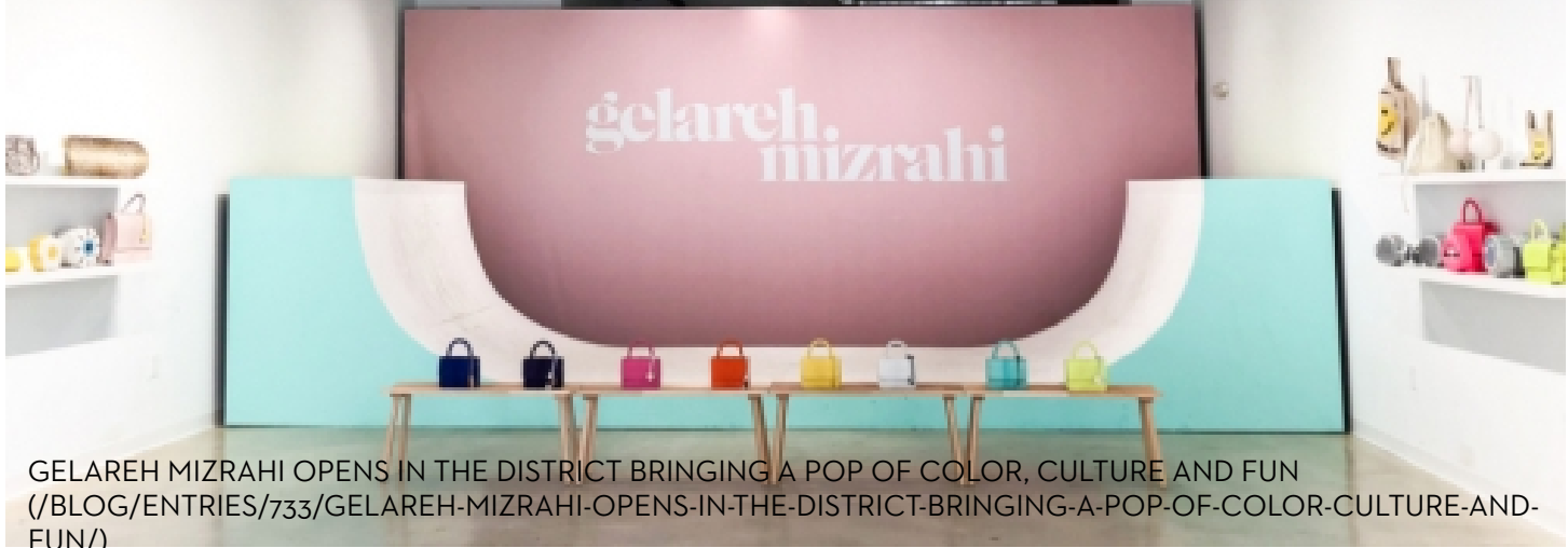
GELAREH MIZRAHI OPENS IN THE DISTRICT BRINGING A POP OF COLOR, CULTURE AND FUN (/BLOG/ENTRIES/733/GELAREH-MIZRAHI-OPENS-IN-THE-DISTRICT-BRINGING-A-POP-OF-COLOR-CULTURE-AND-FUN/) (/blog/entries/733/gelareh-mizrahi-opens-in-the-district-bringing-a-pop-of-color-culture-and-fun/)